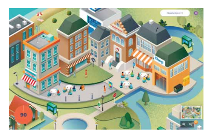
Figure 4. Explaining privacy behaviour